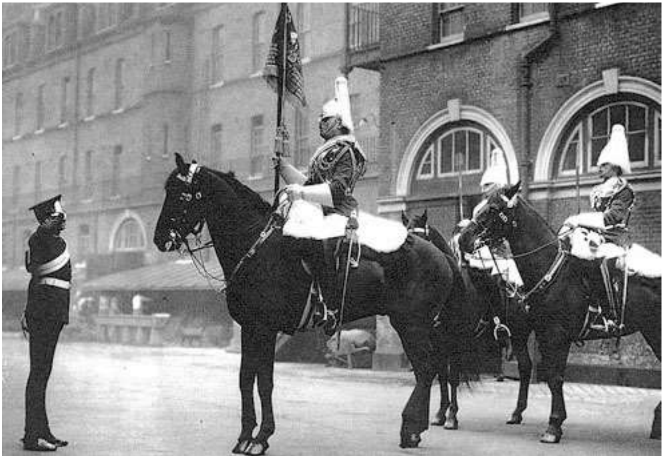
Life Guards on Duty circa 1905. (Under Edward VIII)