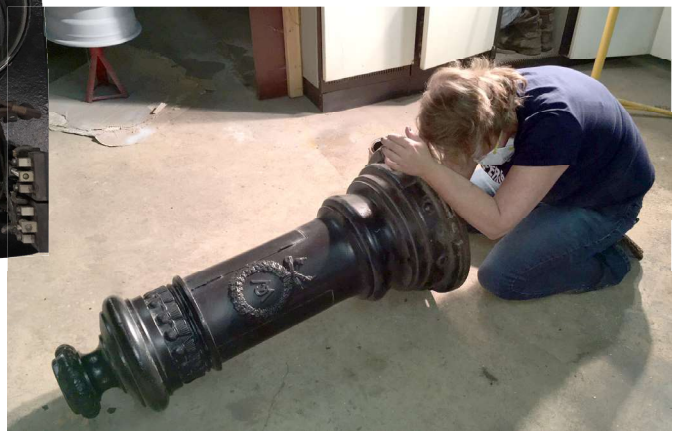
Dawn painting the inside of the lower call box base.