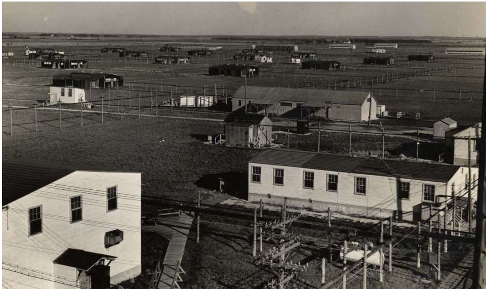
Defence Industries Ltd., Transcona Cordiate Plant. Courtesy of the Transcona Museum and Archives, TH99.46.4

At its height, the Transcona Plant consisted of 230 buildings, including a hospital, machine shops, offices, residences, telephone exchange, laundry, and numerous production buildings. Given the sensitive nature of goods produced at the plant, the site had its own fire hall and a reciprocal agreement with the Transcona Fire Department to share resources in a time of need. 1