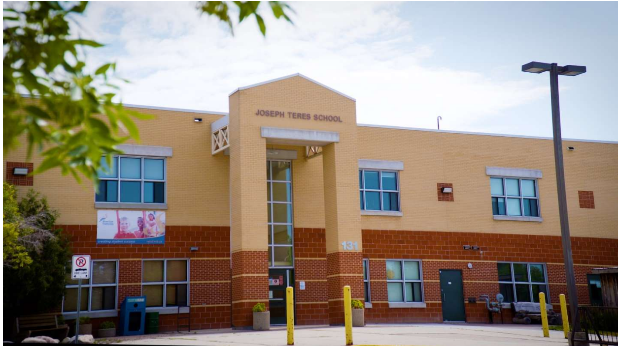
Joseph Teres School, 131 Sanford Fleming Road.