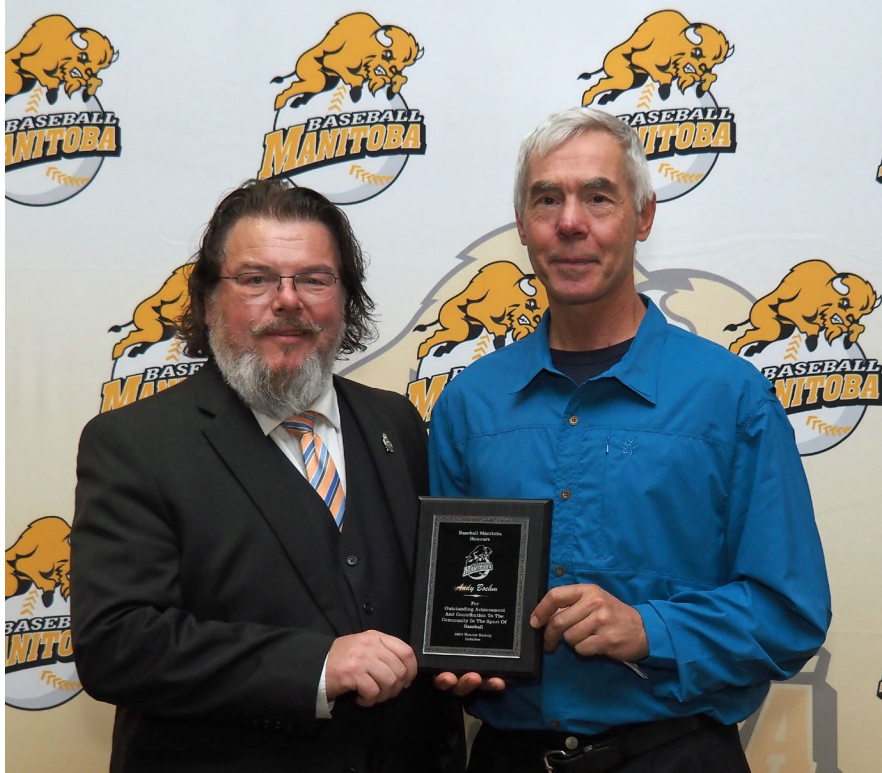
Baseball Manitoba, 2022 Honour Society Induction